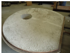
Pusher Plates / Ladle Bottoms Forge/Heat Treat