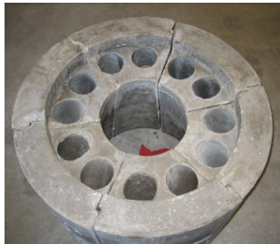
Muffle Block CPI/Chemical