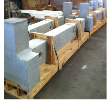
Custom Piers Forge/Heat Treat