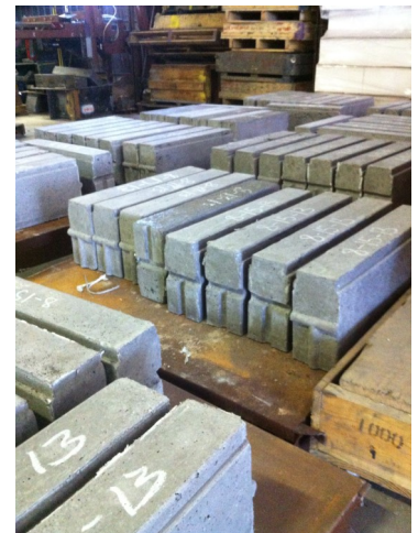
Walking Beams Forge/Heat Treat