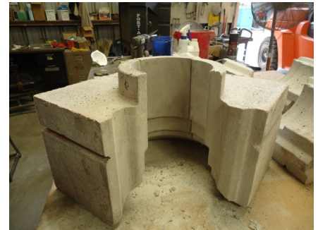
Burner Tile CPI/Chemical