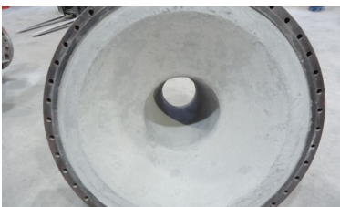
TLE Nose Cone CPI/Chemical